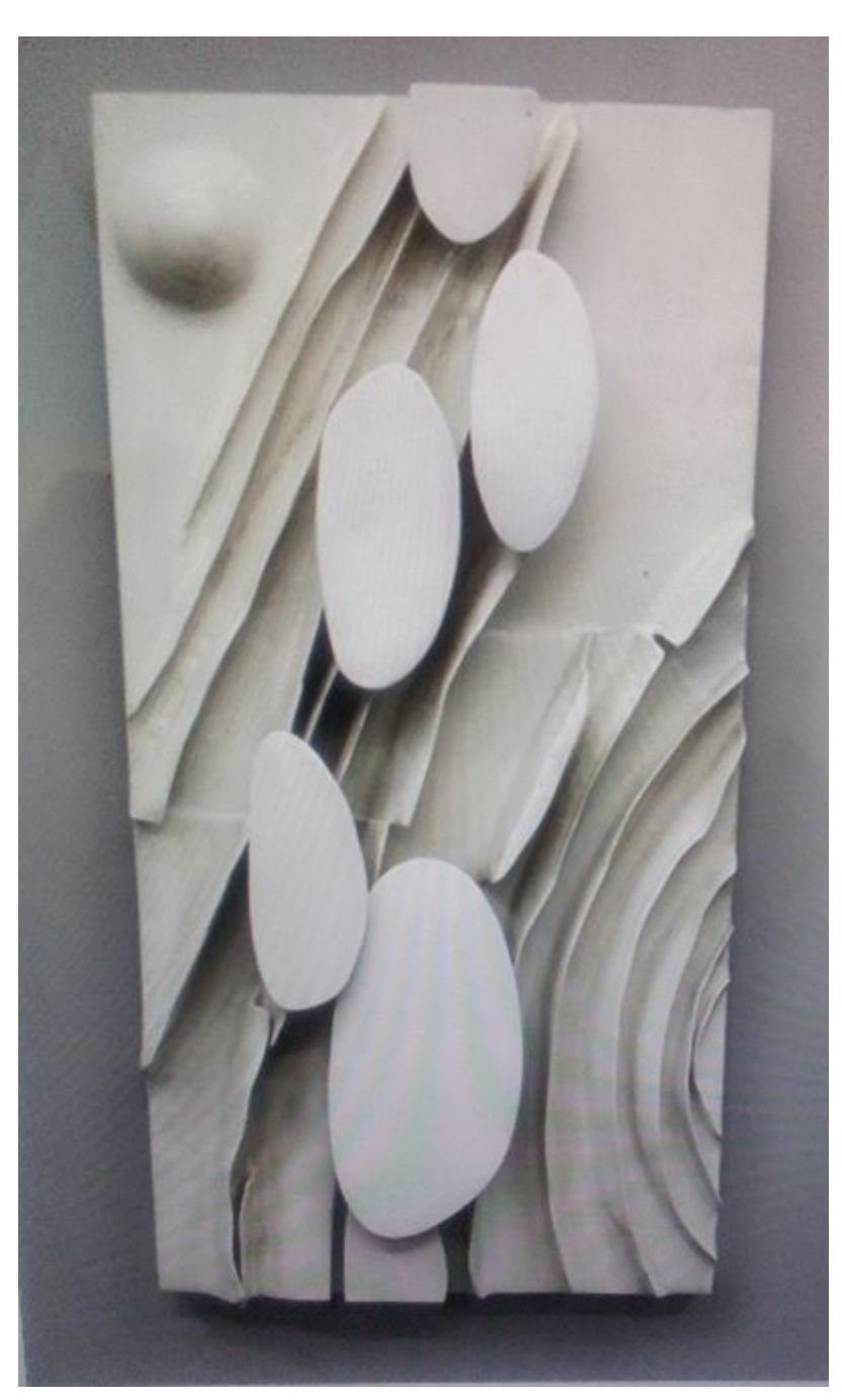
Untitled (Wall Sculpture), Ruth Duckworth, 1970, porcelain, 33-3/4 x 17-1/2 x 5 1/2 in. at the Smart Museum, University of Chicago.

In Ruth's words: "I think of life as a unity. This includes mountains, mice, rocks, trees, women and men. It's all one big lump of clay."