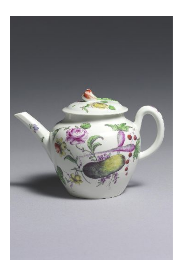
Teapot and Cover, rare vegetables, Dr Wall Worcester, porcelain circa 1757. Height: 4 1/2 in. (11.5 cm) Private collection.

Zoom has instituted updates, so please make sure you've updated your Zoom account as necessary before clicking on the link sent to you by Zoom for your use on November 13.